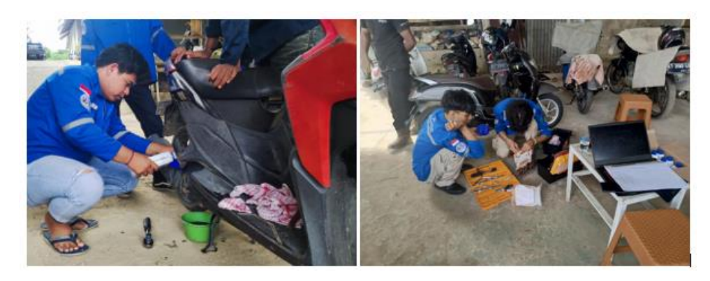
Figure 3. Vehicle Checking by the Work Team

This observation highlights the varying maintenance needs among the inspected motorcycles. Those requiring multiple maintenance actions likely had several underlying issues necessitating comprehensive attention. It emphasizes the importance of thorough diagnostics to identify all potential problems for effective maintenance and the prolonged lifespan of motorcycles. The training program effectively equipped participants with the skills needed to perform a broad range of maintenance tasks, enabling them to address various issues identified during diagnostics.