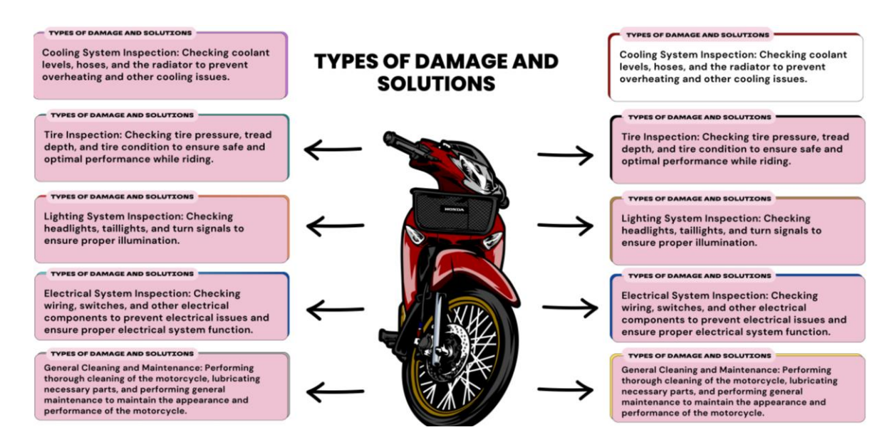
Figure 1. Photos of Motorbike Repair and Service Items