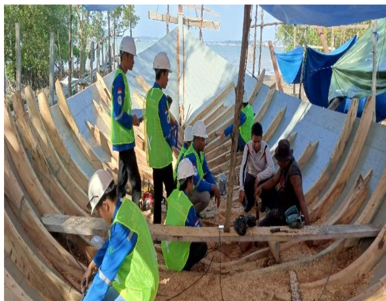
Figure 5. Hands-on inspection of wooden shipbuilding

Building a wooden ship without clear and detailed design drawings can have various serious consequences, both from a technical, economic and operational perspective. From a technical perspective, ships built without a design are at risk of experiencing construction errors, such as uneven load distribution, dimensional discrepancies, or the use of suboptimal materials, which can reduce the ship's strength and stability. Economically, the work process is often slower and more wasteful because there is a greater possibility of revisions or disassembly due to errors, which ultimately increases production costs.