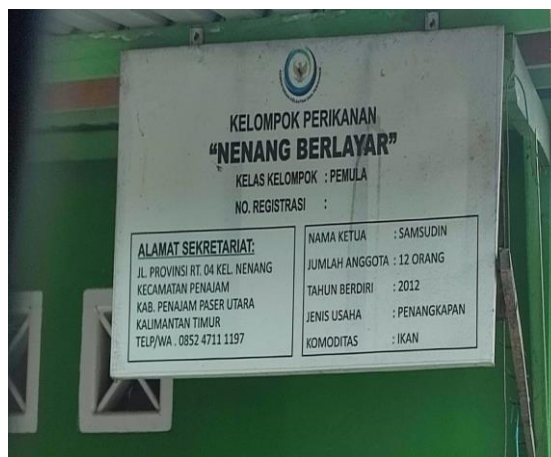
Figure 1. KUB Nenang Berlayar

CAD Technology Training and Workshop with the Pierre Bouguer Approach: This program aims to introduce Computer-Aided Design (CAD) technology to wooden ship craftsmen at KUB Nenang Berlayar. This training will focus on the use of CAD in ship design with the Pierre Bouguer approach, which helps ensure the balance and stability of ships scientifically. [6]. KUB Nenang Berlayar in North Penajam Paser faces challenges in maintaining and increasing the efficiency of the traditional wooden shipbuilding process. With methods that still rely on inherited skills and intuition, ship craftsmen often face difficulties in achieving precise final results that match the initial design. This reliance on conventional techniques not only affects product quality, but can also lead to safety and vessel performance issues. Amid global demands to improve efficiency and quality, efforts need to be made to bring significant change to these communities so they can compete more effectively.