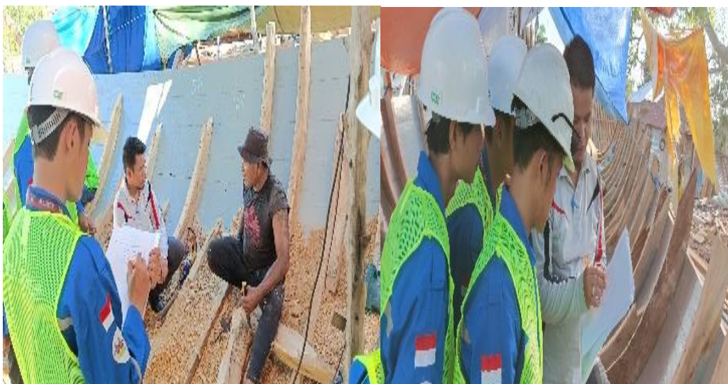
Figure 7. Educate craftsmen about shipbuilding by making designs using AutoCAD.

Measuring the main dimensions of a traditional wooden ship is an important step in ensuring that the ship is built according to the owner's needs and requests. This process includes measuring main dimensions such as the length, width and height of the ship which will later become a reference for determining the ship's capacity. In practice, this main size is often the main benchmark for ship owners to ensure the ship is able to accommodate certain desired loads or functions. However, in the construction of traditional wooden ships, it is often found that technical aspects such as the thickness of the trusses, the distance between the trusses, and the construction calculation analysis are not designed in detail. The thickness of the tusks, which are the backbone of the ship's structure, plays a crucial role in maintaining the ship's strength and stability. If this thickness is not designed properly, the ship's structure can become weak and susceptible to damage, especially when facing tough operational conditions.