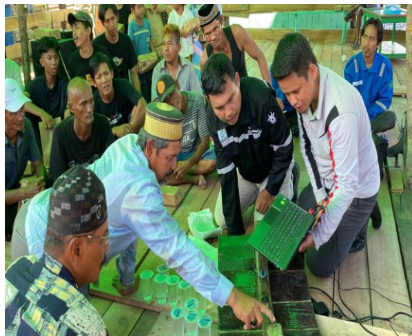
Figure 3. AutoCAD Introduction Workshop for wooden ship craftsmen

The line plan is very important in ship design because it serves as the first step to ensure that the hull shape meets the criteria of hydrodynamics, stability, payload capacity and fuel efficiency. By studying the lines plan, ship designers can evaluate whether the hull shape is able to reduce water resistance and provide optimal speed and efficiency [9]. In the ship design process, line plans allow designers to carry out design iterations systematically. If the results of the analysis indicate the need for modifications, such as reducing drag or increasing stability, changes can be applied directly to the lines plan. Thus, the lines plan is not only a visualization tool, but also an analysis and communication tool between designers, engineers and shipbuilders. This entire process makes the lines plan an essential component in modern ship design, connecting the initial concept to the realization of the ship in the field.