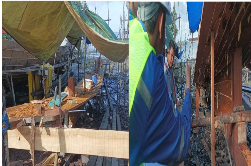
Figure 4. Initial stages of building a wooden ship

Making wooden ships in North Penajem Paser still relies on traditional methods without taking into account design. Through this workshop, traditional shipbuilders are invited to combine local wisdom with modern technology, so as to increase the competitiveness of the local shipping industry without ignoring traditional values. This workshop also opens up opportunities for shipbuilders to produce more competitive designs, both for domestic and international markets. The hope is that this technology can be implemented in a sustainable manner to encourage economic progress in local communities.