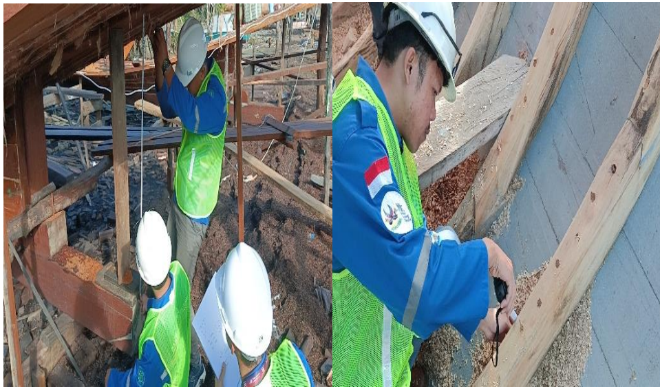
Figure 6. Measurements of wooden ships

Measuring the main dimensions of a traditional wooden ship is an important step in ensuring that the ship is built according to the owner's needs and requests. This process includes measuring main dimensions such as the length, width and height of the ship which will later become a reference for determining the ship's capacity. In practice, this main size is often the main benchmark for ship owners to ensure the ship is able to accommodate certain desired loads or functions. However, in the construction of traditional wooden ships, it is often found that technical aspects such as the thickness of the trusses, the distance between the trusses, and the construction calculation analysis are not designed in detail. The thickness of the tusks, which are the backbone of the ship's structure, plays a crucial role in maintaining the ship's strength and stability. If this thickness is not designed properly, the ship's structure can become weak and susceptible to damage, especially when facing tough operational conditions.